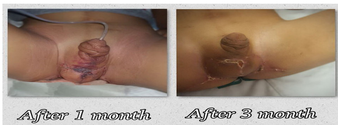
Figure 3. Follow up after twenty days and also after three months

Overall the resultant appearance is acceptable and the parents were satisfied with the outcomes of the surgery. This new technique of scrotoplasty with raised perineal flaps and de-epithelialized border is a good option in cases of scrotal destruction and agenesis and does not require an uncircumcised condition.