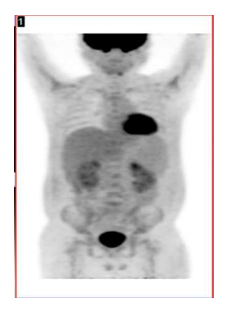
Figure 3.PET demonstrated enlarged kidneys with abnormal intense cortical FDG accumulation and intense patchy uptake in the bone marrow of multiple bones in axial and appendicular skeleton.