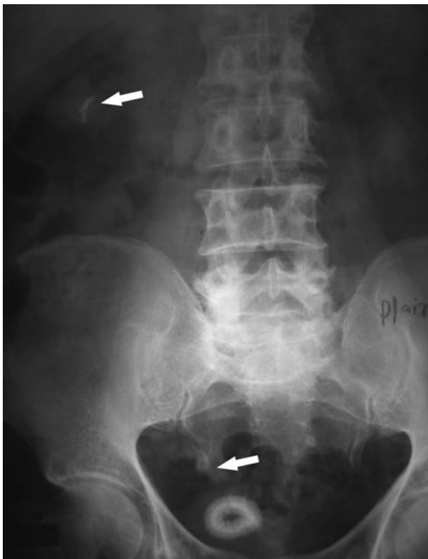
Figure 1. Plain abdominal radiography shows coiled double J stent in the kidney and bladder region with encrustation (arrows).

A 56-year-old man presented with the history of frequency, urgency, and dysuria for 2 months. He had undergone right open pyelolithotomy 10 years earlier. On evaluation, serum urea and creatinine values were within normal limits. Urinalysis revealed microscopic pyuria and hematuria. Urine culture was positive for Escherichia coli . Ultrasonography of the kidney revealed a normal left kidney, but