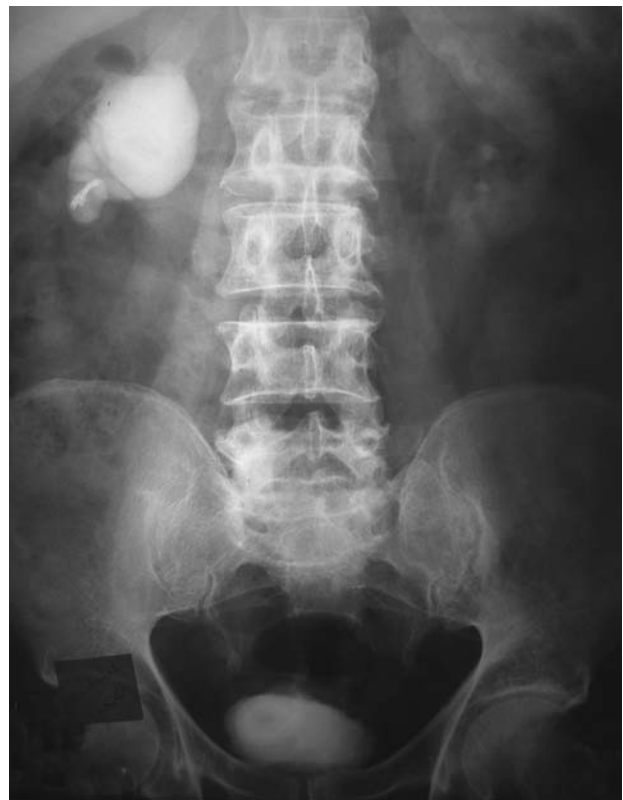
Figure 2. Intravenous urography shows good function of the right kidney.