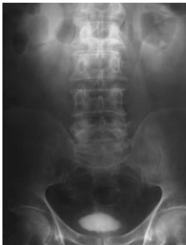
Figure 5. Follow-up intravenous urography shows good function and drainage of the right kidney.

Nephrostography on the 7th postoperative day showed prompt drainage with no evidence of extravasation. Intravenous urography at the 6th week revealed prompt drainage of the contrast medium (Figure 5).