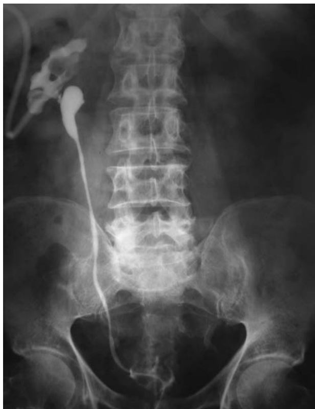
Figure 3. Bidirectional contrast study reveals pelvic stenosis.

The patient was treated by antibiotics according to the microbial sensitivity test results. Cystolithotripsy and right percutaneous nephrostomy were then performed. Antegrade and retrograde imaging study were suggestive of hourglass pelvic stenosis (Figure 3). The patient was subjected to right percutaneous nephrolithotomy followed by transperitoneal laparoscopic pyelopyeloplasty (Figure 4). His postoperative recovery was uneventful.