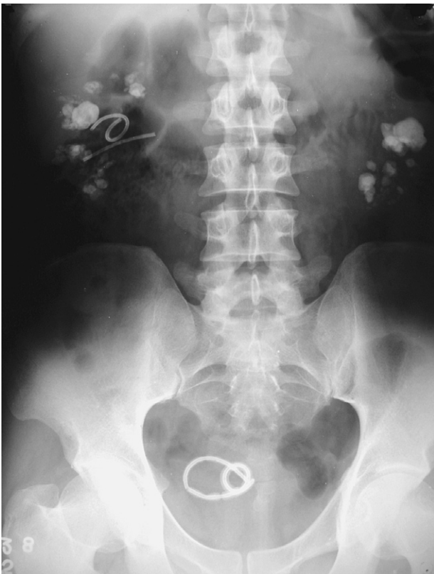
Figure 2. Plain abdominal radiography of the patient showed fragmented pieces of the stent in the bladder and the right pyelocaliceal system.